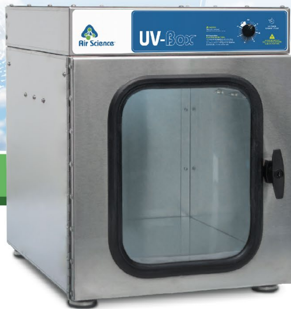
— Model UVB-15