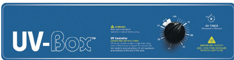
UV timer permits user to set decontamination time and cycle, or to hold operation.