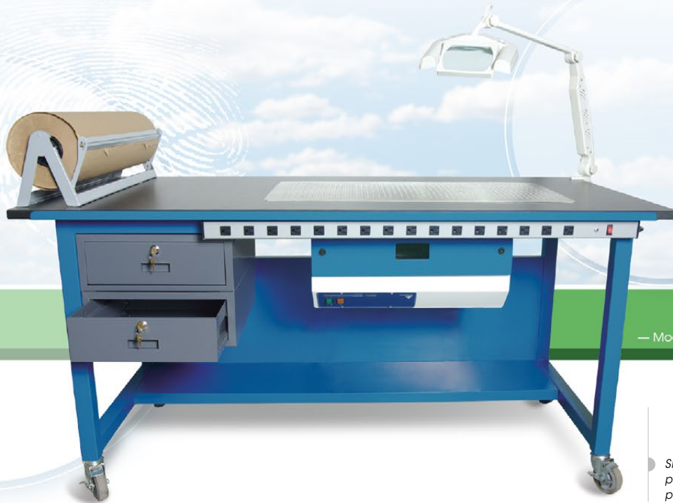
— Model EVB-72

Shown with optional airflow pod, magnifying lamp and power package outlet strip.