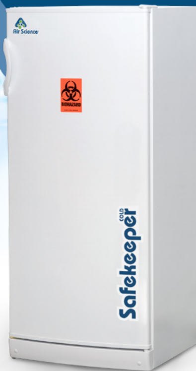
Safekeeper ® COLD